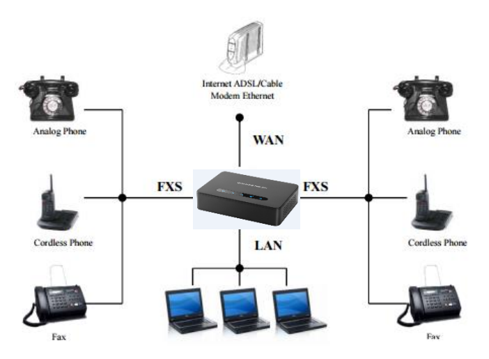
Figure 5: Connecting the HT812/HT814

Note : Please make sure to enable NAT Router under Web GUI \rightarrow Basic Settings \rightarrow Device Mode.