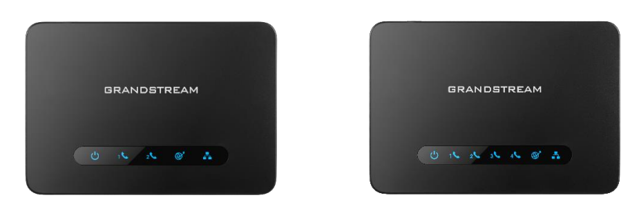
Figure 6: HT812/HT814 LEDs Pattern

There are four (4) LED types that help you manage the status of your HT812/HT814.