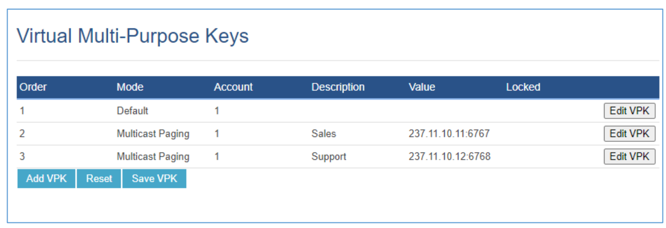
Figure 1: Sending Multicast Page Configuration by using VPK

The Figure 1 and Figure 2 show the example of setting Line Keys/MPK to multicast page sending key.