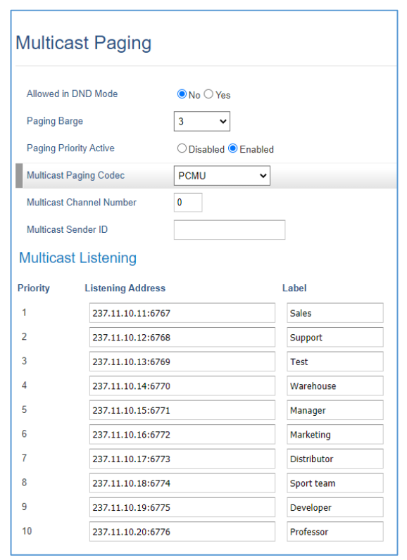
Figure 4: Multicast Paging

Note: The multicast page configuration requires rebooting to take effect.