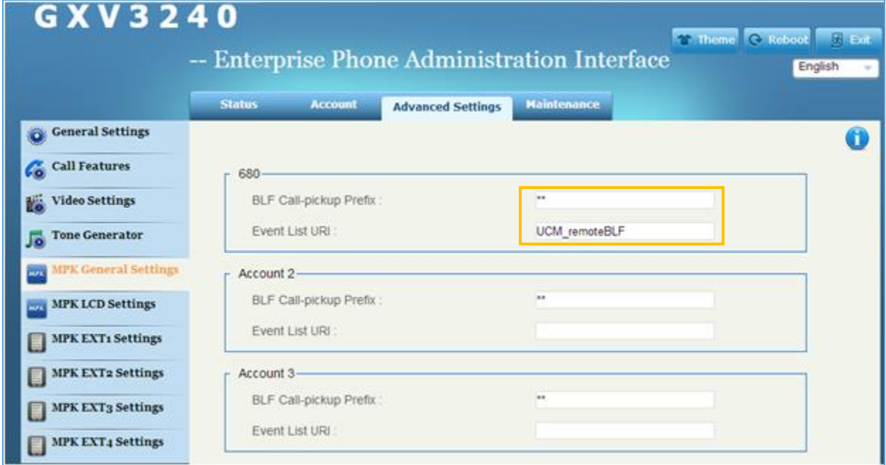
Figure 2: Configure GXV3240 Event List URI