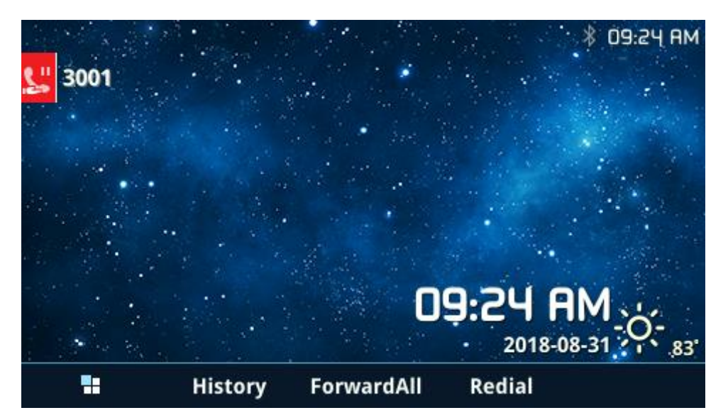
Figure 12: SCA Line on Hold