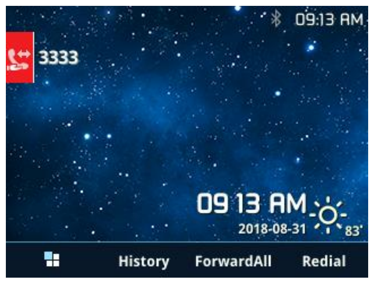
Figure 9: SCA Line Busy Indication on GXP21XX

If the call is answered and the line is busy, this will be reflected on the other phones as shown on the figure below: