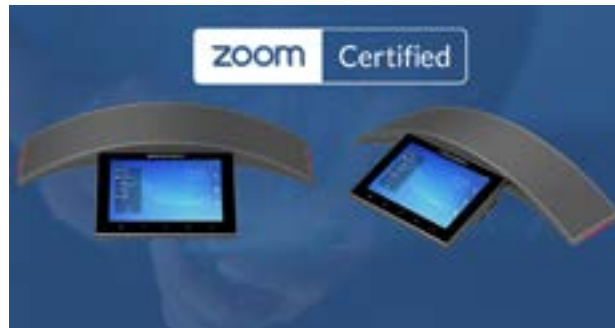
Social Image w/o Text