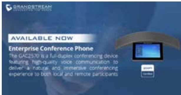
Social Image w/ Text

Use the editable template to customize your own social image by adding your logo, or create your own using the elements provided below. Photoshop files as well as PNGs are provided for each product. For paid social promotion it is recommended to use social images with limited to no text.