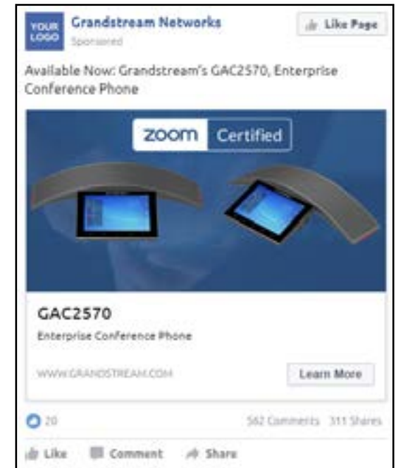
Suggested Social Post Copy