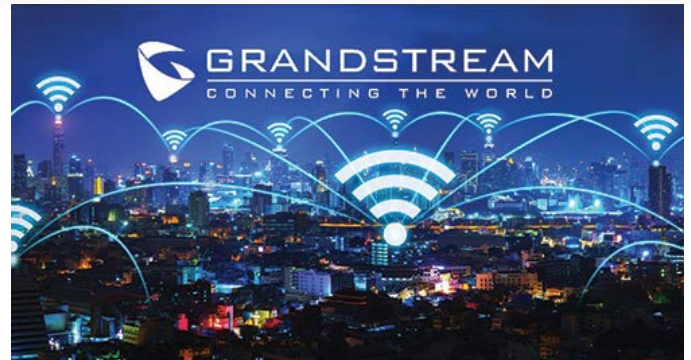
UC Today Article The Future of the Office is Fully Wireless