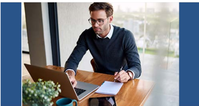
IDG White Paper Supporting the Hybrid Workforce With Integrated IT