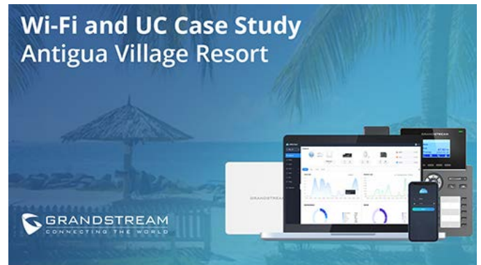
Case Study Antigua Village Resort