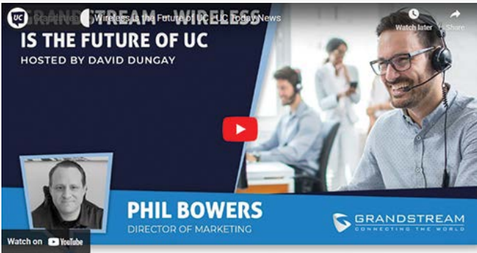
Video Interview with UC Today Wireless is the Future of UC