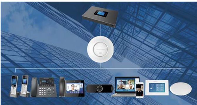
Wi-Fi Voice & Video Solution Page Grandstream Landing Page