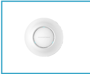
GWN7664 Enterprise Wi-Fi Access Point Enterprise- Grade AP