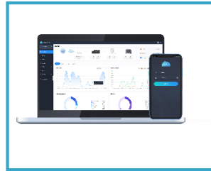
GWN.Cloud Cloud Management Platform Access Point Management