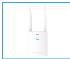
GWN7660LR Outdoor Long-Range Wi-Fi 6 Access Point Outdoor areas of the hotel