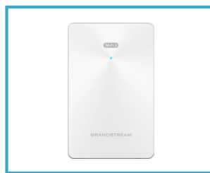
GWN7624 In-wall Wi-Fi 6 Access Point Hotel Rooms