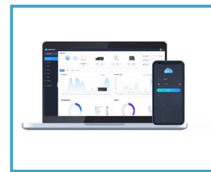
GWN.CLOUD Cloud Management Platform Access Point Management