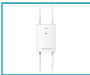
GWN7664LR Outdoor Long-Range Wi-Fi 6 Access Point Outdoor Coverage