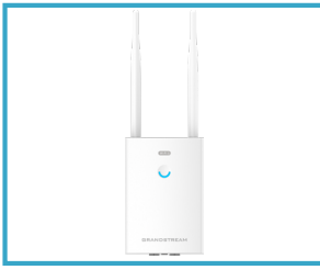
GWN7660LR Outdoor Long-Range Wi-Fi 6 Access Point Outdoor Coverage