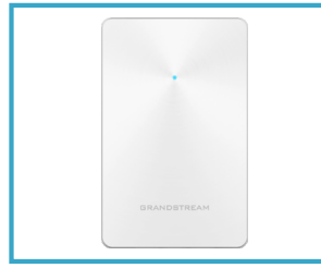
GWN7624 In-wall Wi-Fi Access Point Indoor Coverage