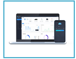
GWN.Cloud Cloud Management Platform