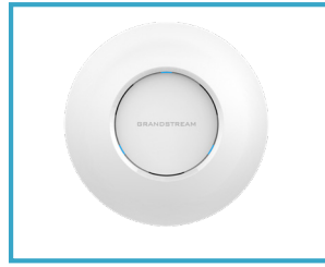
GWN7605 Wi-Fi AP Indoor Access Point