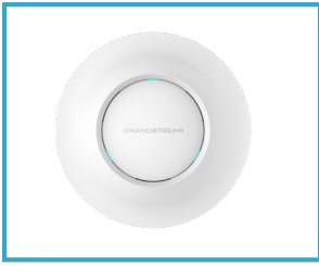
GWN7630 Wi-Fi 6 Indoor Access Point