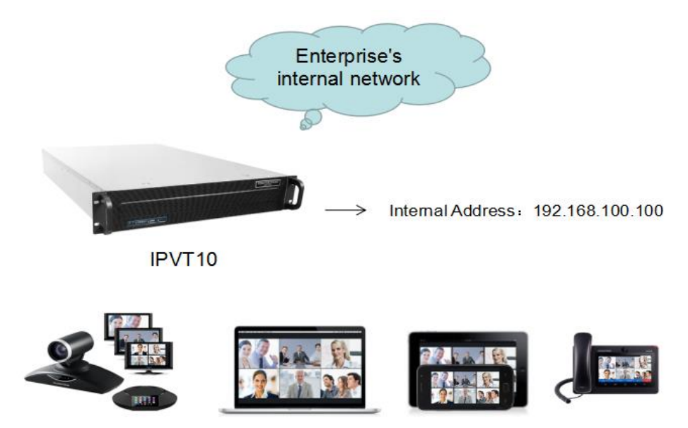
Figure 1: Network Deployment Diagram - Internal

The server is deployed on the internal network. The users use the service via internal network. Users need to configure the internal network IP address for the server. If users register accounts and start conferences on the internal network, and other participants are all on the internal network, users could only deploy the server on the internal network, and only configure the internal network adapter. For example, users could configure this server in the private networks.