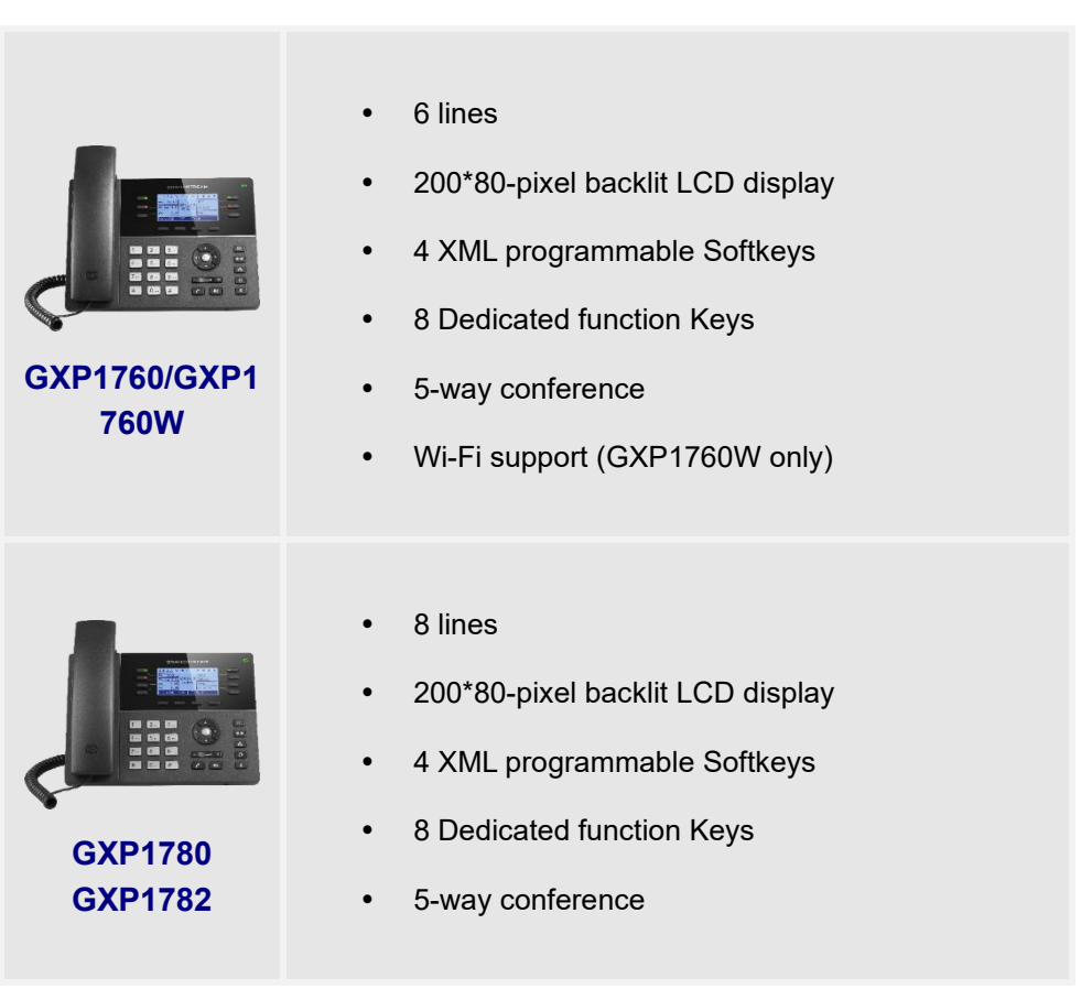
Table 1: GXP1760W/GXP1780/GXP1780 Features at a Glance

The following table contains the major features of the GXP1760W & GXP1780/82: