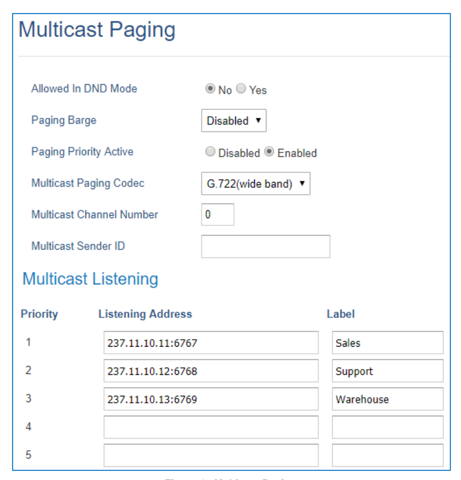
Figure 4 : Multicast Paging

To receive multicast page, the GRP26XX must be well configured to listen to the right address and port. The configuration is set up under Web UI > Settings > Multicast Paging . There are 10 listening address supported with priority levels 1 to 10. Optionally, each of these addresses can also have a label that will display on LCD when the page is received.